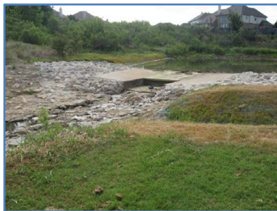
Care and maintenance of retention areas within Grand Prairie, Texas, allow stormwater and flood waters to be stored and released more slowly into the drainage system. At left: an overgrown and clogged channel. At right: the same area after proper maintenance.