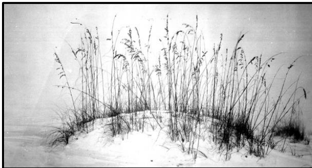
Figure 2: Photograph of sea oats, Uniola paniculata , demonstrating the ability of beach dune vegetation to trap windblown sand and build dunes.

Cutting dune vegetation seaward of a coastal construction control line requires a CCCL permit unless the activity qualifies as a minor activity determined by the department not to have an adverse effect on the coastal system, such as “maintenance of existing beach-dune vegetation” exempted in state law. Vegetation maintenance that does not damage native dune plants includes trimming, shearing, pruning, dead heading and other accepted horticultural practices, and does not require a CCCL permit pursuant to section 161.053(11), F.S. An exemption of the work from CCCL permitting requirements does not shield the property owner from his or her responsibility for following other laws or from enforcement action taken by other local, state, or federal agencies. Furthermore, proper arboricultural and horticultural practices must be followed to ensure that the native beach-dune plants are not damaged or destroyed from the maintenance. Trespass onto another’s property to remove vegetation without the property owner’s approval is also not allowed.